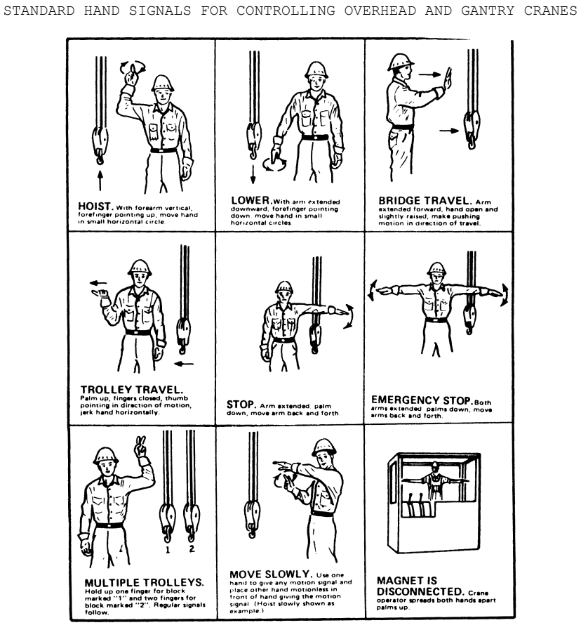
(3) The following hand signals must be used for derricks and a copy must be posted in the cab at the operator's station.